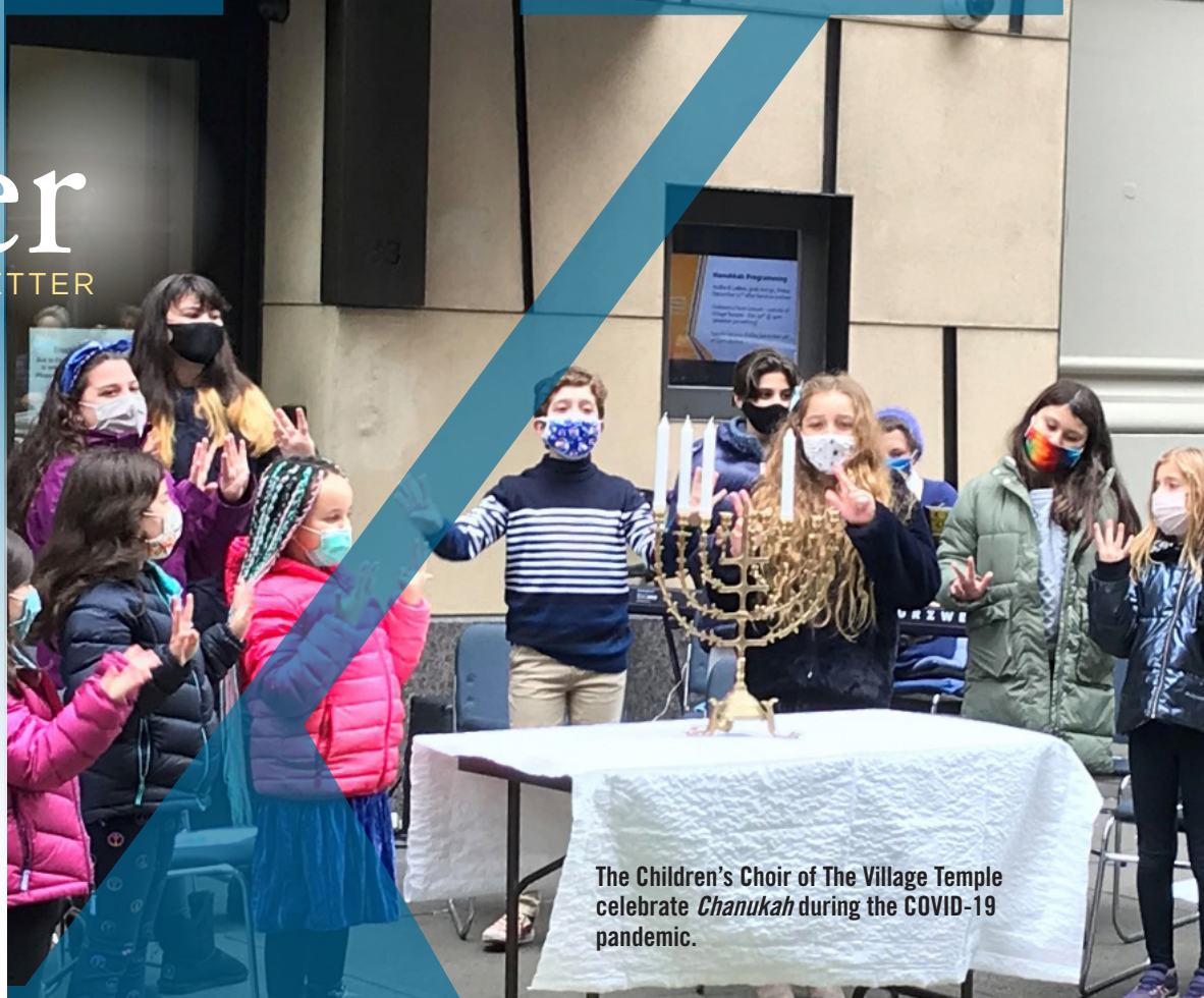
The Children's Choir of The Village Temple celebrate Chanukah during the COVID-19 pandemic.