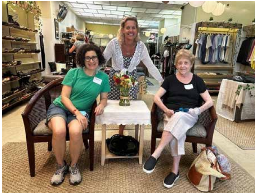
VT volunteers at The Little Shop of Kindness

The Village Temple Social Action Committee and Dayenu Circle welcomes congregants of all ages to join us this year in learning and Tikkun Olam . Our committee meets monthly, at lunchtime on Fridays. If that time doesn't work, reach out and we can brainstorm other ways to get involved. Everyone can help!