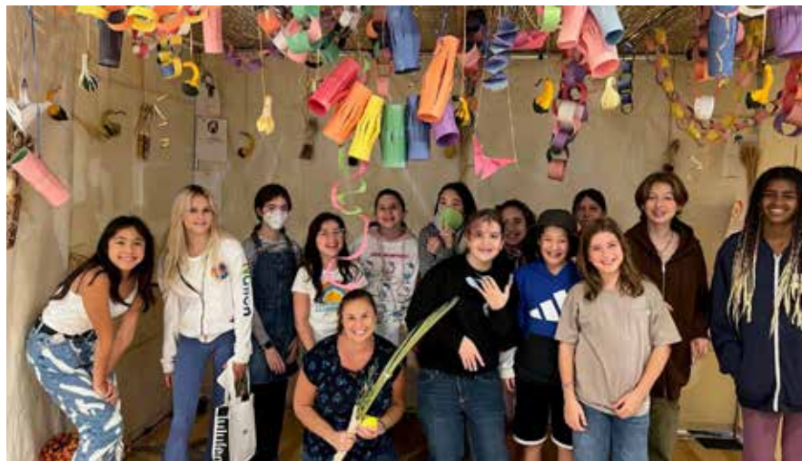
Above and top right: B'nai Mitzvah students celebrating Sukkot.

We also encourage the teens to be Teaching Assistants (TAs) in the classrooms and to help with the younger kids. A great way to get those community service hours! Have your teen reach out to me via text if they want to help on Tuesday or Wednesday afternoons or Sunday mornings.